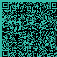
JORGE FARIA City Mayor

Investimento Turístico Turistic Investment